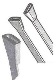
©2013 SERON MFG. CO. PUBLISHED 2/1/2013

Celebrating over 67 Years As the First and Finest As always: MADE IN U.S.A.