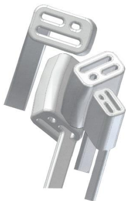
©2018 SERON MFG. CO. PUBLISHED 12/28/2018